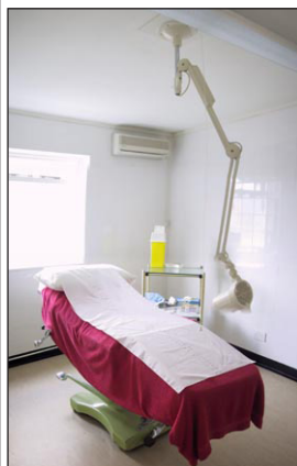
Minor Operations Theatre